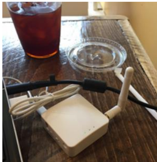
Figure 2. P26's mobile firewall/VPN device.

Personal and organizational preferences also reinforce the privacy of mobile work performed across various locales. P37 (a clinical research associate) noted: “I told my boss I would be probably working in a coffee shop and she was like, ‘oh, you should probably get a privacy screen and it’s a requirement of the company,’ but I think a lot of people don’t have them.”